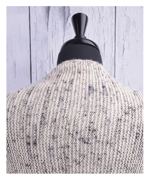
MATERIALS 3 skeins Madelinetosh Tosh Merino Light in gradient or bold shades (420 yards, 113g each)

Sample Yarn Colours 1 skein Tosh Merino Light Optic (A) 1 skein Tosh Merino Light Birch Grey (B) 1 skein Tosh Merino Light Salt (C)