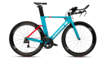
TEAL BLUE MATTE