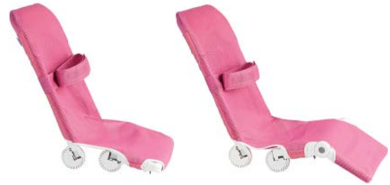
Without calf rest (Z269)